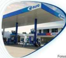
euro 19 Samundri Road, Faisalabad