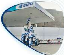
euro 15 Garhi Shahu, Lahore