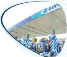
euro 18 Bedian Road, Lahore