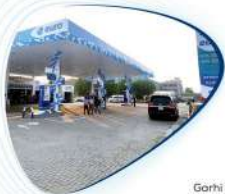
euro 10 Sundar Industrial Estate, Lahore