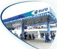
euro 9 Lower Mall Road, Lahore