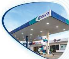
euro 5 MM Alam Road, Lahore