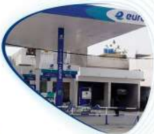
euro 20 Faisal Town, Lahore