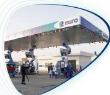
euro 6 East Ahmadpur Road, Bahawalpur