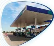
euro 16 Opposite Honda Showroom, Multan